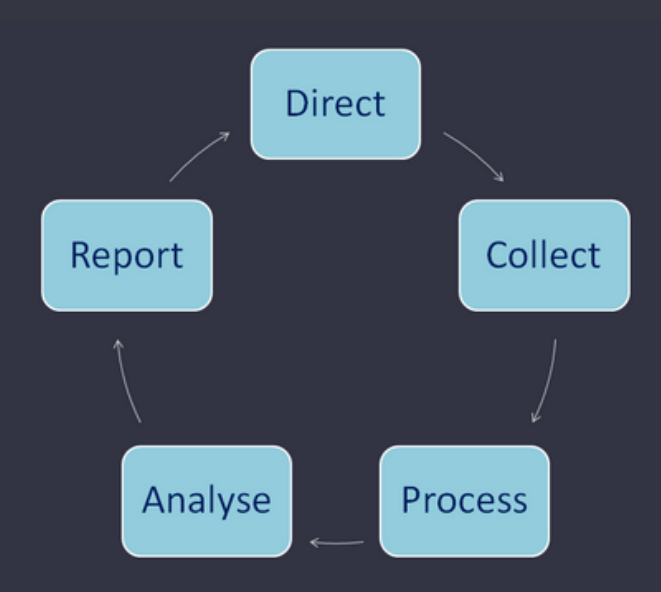
Figure 1: Intelligence Cycle

Following the Intelligence Cycle, our Analysts provide reports tailored to support your decision-making using Artificial Intelligence, cutting edge cyber and scenario-based tools to allow us to develop triggers, indicators and forecasts, to provide your business with the means to anticipate key developments that could impact your operations.